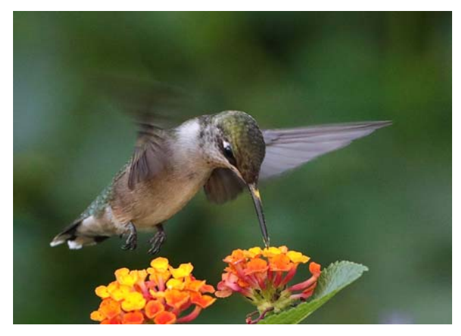
NATURE "Anna's Hummingbird"