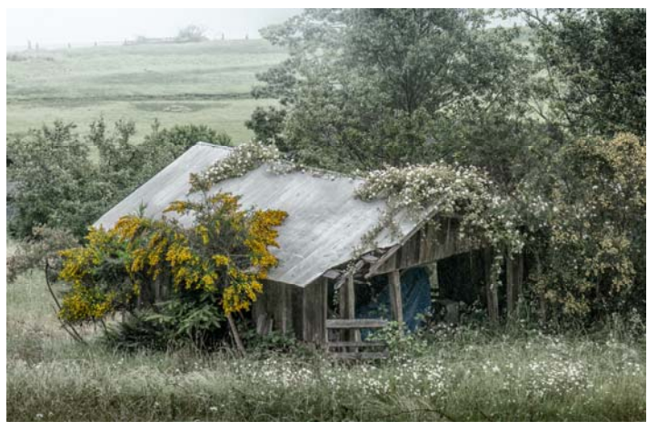
ASSIGNMENT "Flowered Covered Barn" Peter Florczak