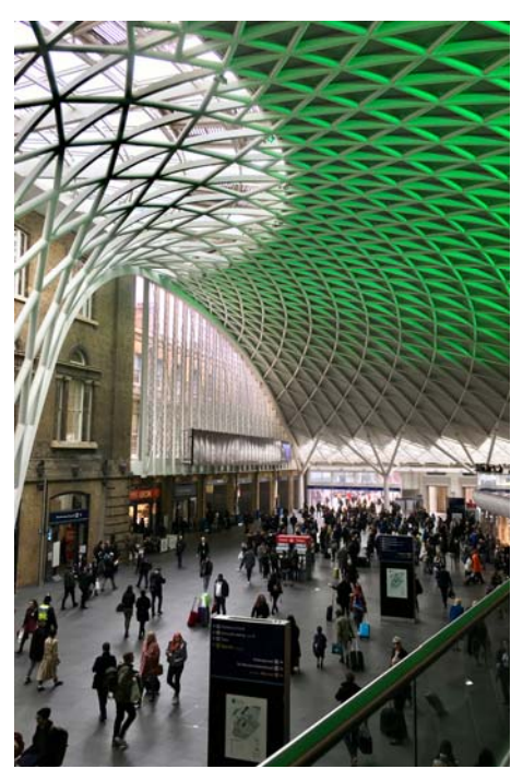
TRAVEL—CREATIVE "London Train Station" Steve Manchester