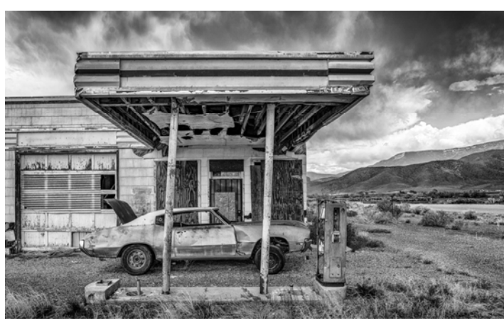
MONOCHROME "Desert Gas Station" Peter Florczak