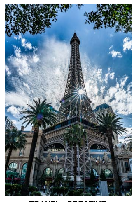
TRAVEL- CREATIVE "Eiffel Tower in Las Vegas" Peter Florczak