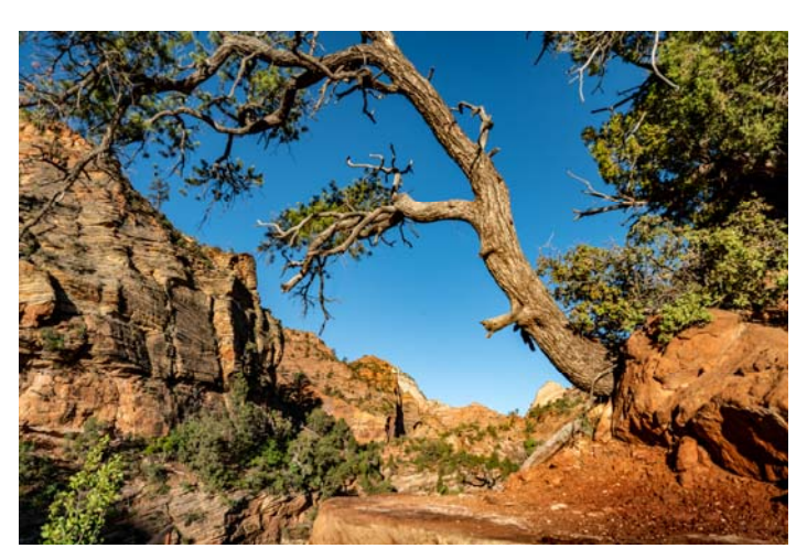
NATURE "Utah Tree" Peter Florczak