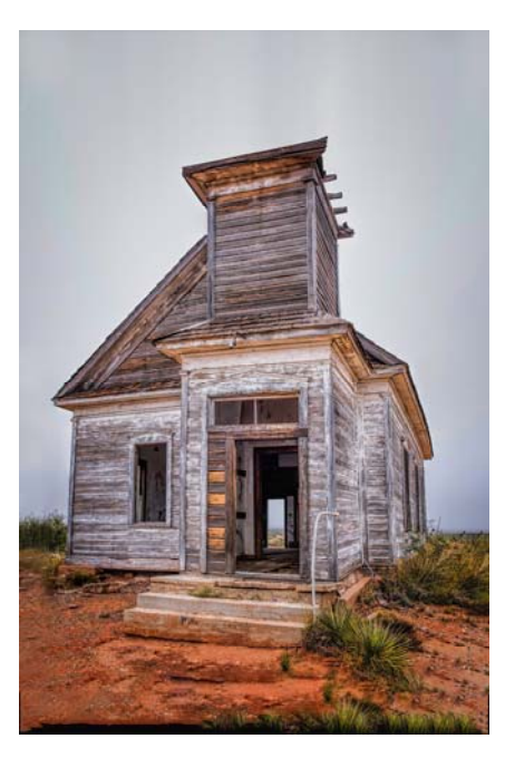
PICTORIAL "Abandoned Church" Dick Boone