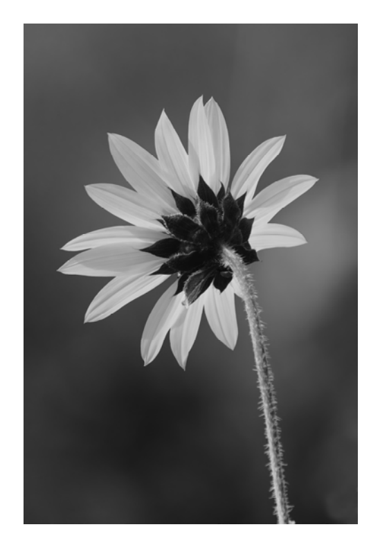
MONOCHROME "Ashy Sunflower" Dick Boone