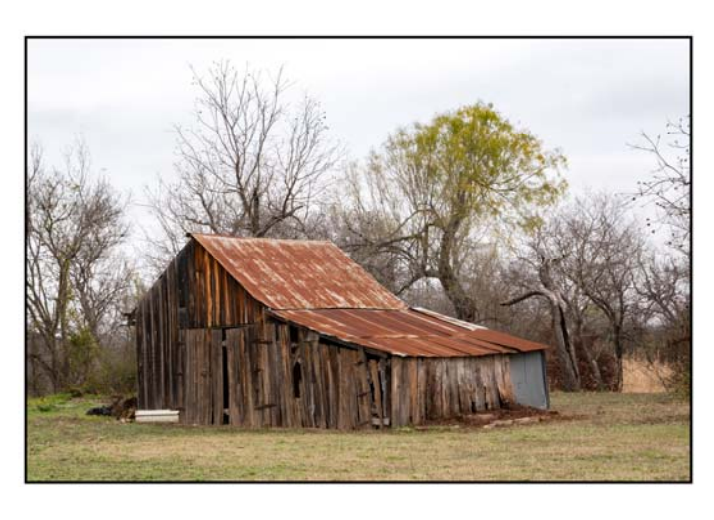
ASSIGNMENT "Old Barn" Dick Boone