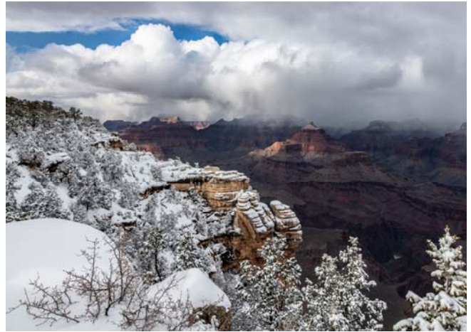
TRAVEL "Cold Vista" – Charles Freeman