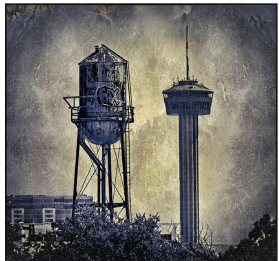
CREATIVE "Two Old Towers" – Dick Boone