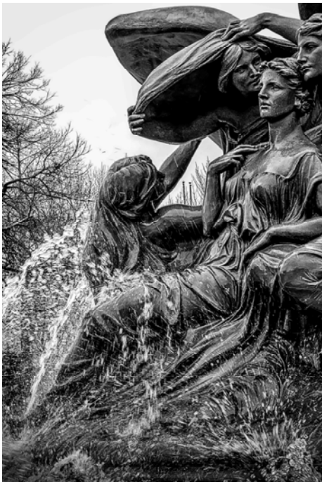
MONOCHROME Peter Florczak "Fountain"