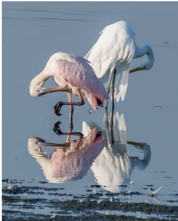
NATURE "Preening Pair"