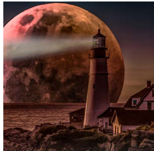
CREATIVE Peter Florczak "Red Moon"