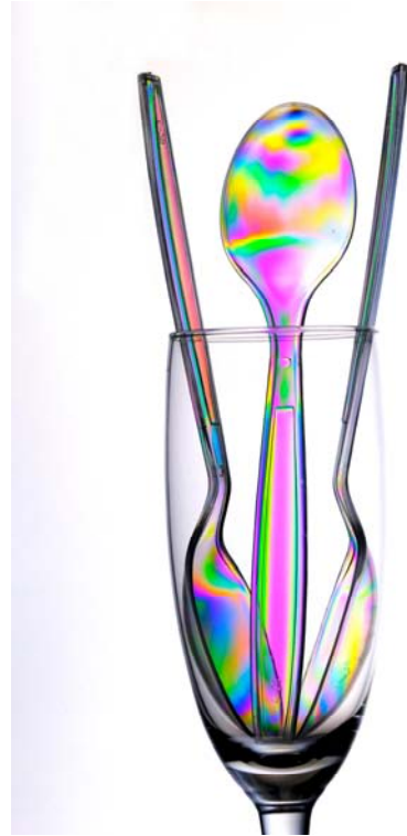
CREATIVE “Three Spoons” Dick Boone