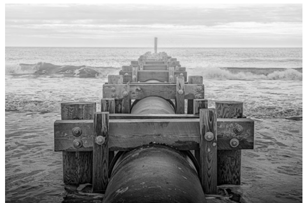
MONOCHROME tied for 3rd Place “Pipe into the Ocean” Peter Florczak