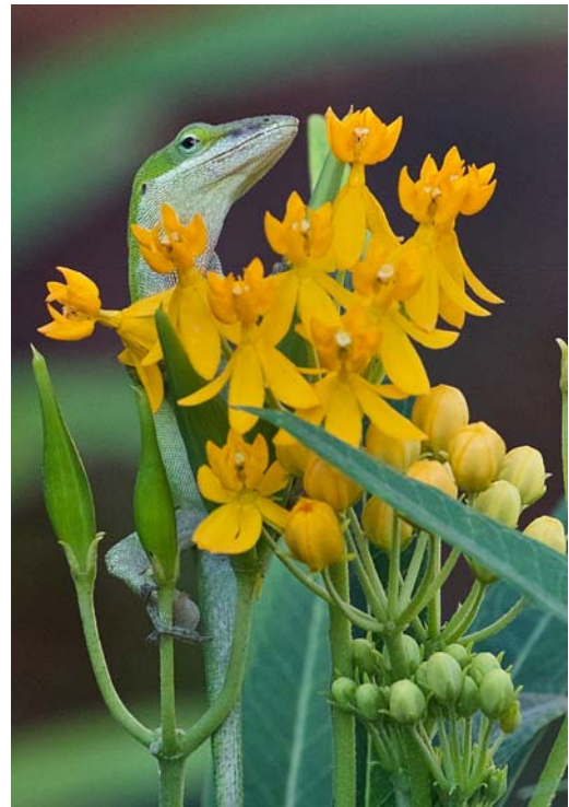
NATURE (Cover photo) “Looking for Lunch” Steve Manchester