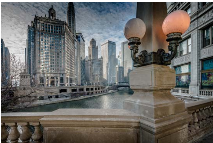
PICTORIAL “Chicago River View” Peter Florczak