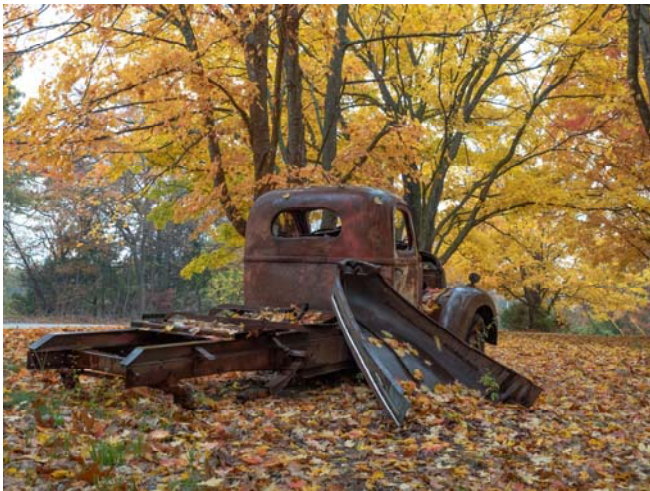
ASSIGNMENT “Old Red” Trish Stone