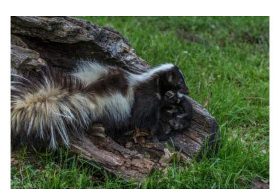
NATURE tied for 1st "Moving Day" Dick Boone