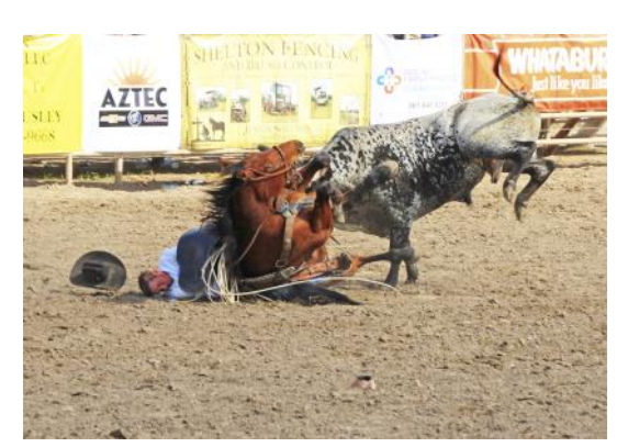
PHOTOJOURNALISM tied for 1st "Bad Bull" Tim Kirkland"