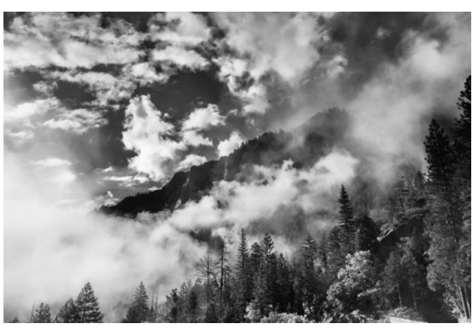
MONOCHROME "Low Clouds at Tunnel View" Brian Duchin