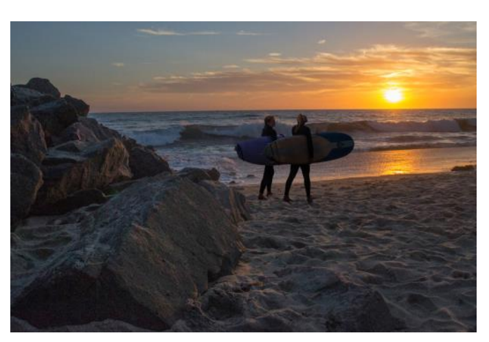
PICTORIAL tied for 2nd Place "Surfing into the Sunset" Brian Duchin