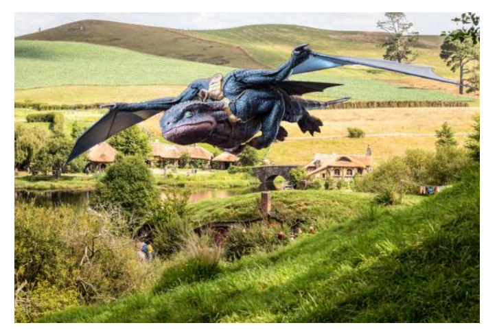
CREATIVE "In Search of a Rider" Bill Hunsicker