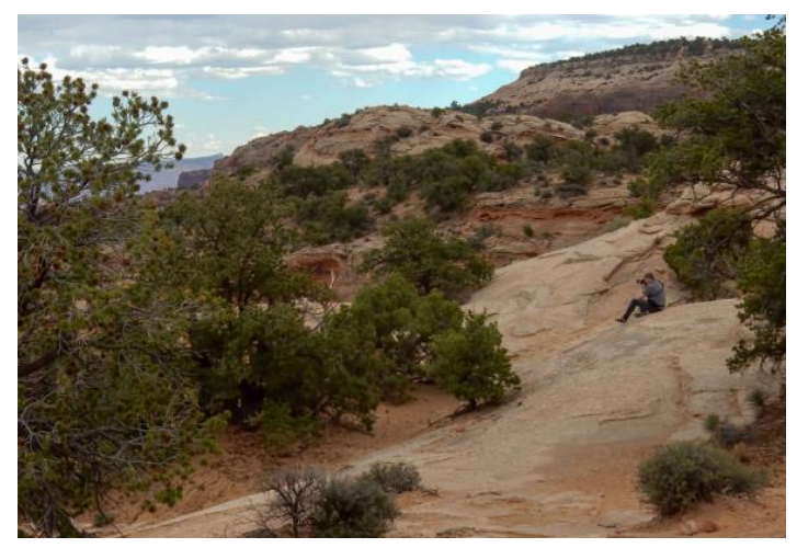
ASSIGNMENT "Photo Time" Sam