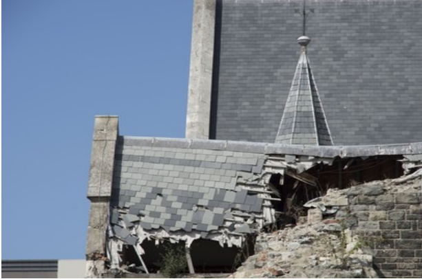
PHOTOJOURNALISM "Cleanup After the Quake"