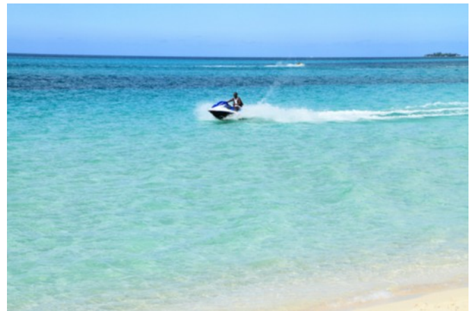
Jet ski, 7 mile beach, Negril, Jamaica

To improve the GSACC's handling of the PJ category I would like to propose changes to the category's rules. There should be no withholding of titles. Images may