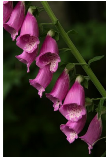
NATURE "Wild Foxglove"