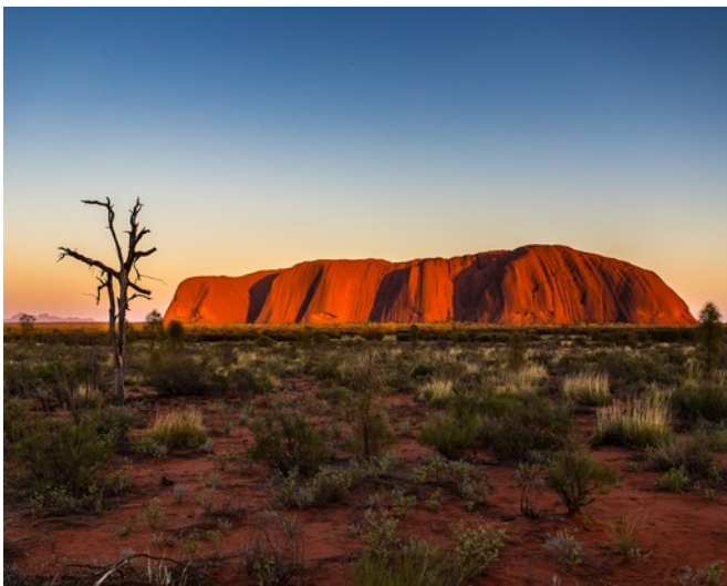
PICTORIAL COLOR "Ulura Sunset" by Bill Hunsicke