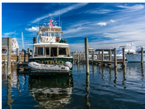
PICTORIAL COLOR "After the Storm" by Peter Florczak