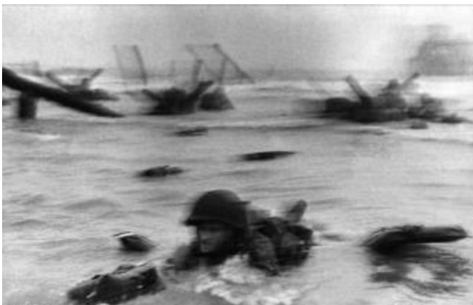
Troops storming beaches at Normandy June 6, 1944

Robert Cappa was a renowned PJ embedded with the troops when they stormed the beaches at Normandy. There were several photos taken that day. Many of the same event. Many were much better than Cappa's. But by the time they were published they lost their relevancy. Robert Cappa's photos best met the principles of PJ at the time. Here is one of his most famous photos of D-day.