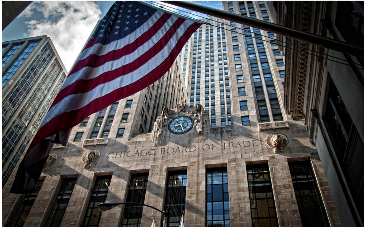
Chicago Board of Trade