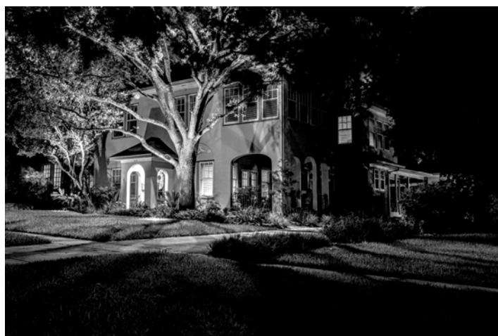
"215 at Night" Dick Boone