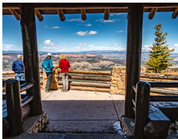
"Looking into the Canyon" Peter Florczak