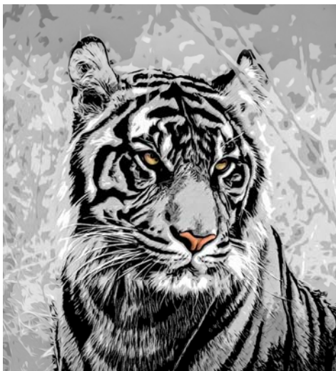
CREATIVE "Eye of the Tiger" Peter Florczak