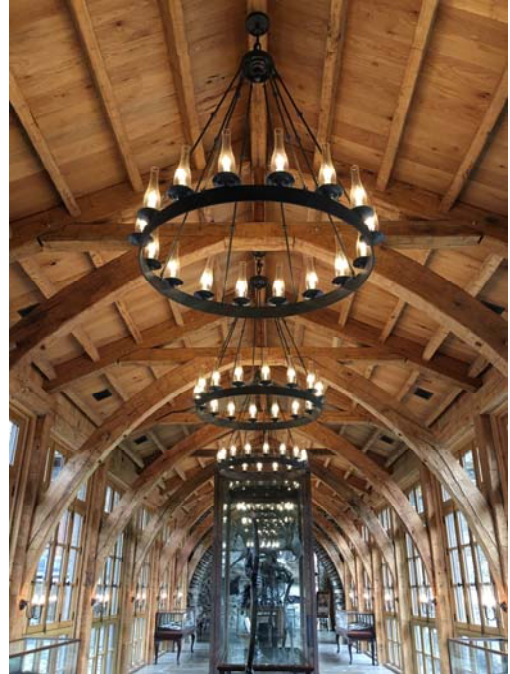
PICTORIAL "Dogwood Canyon Center" Trish Stone