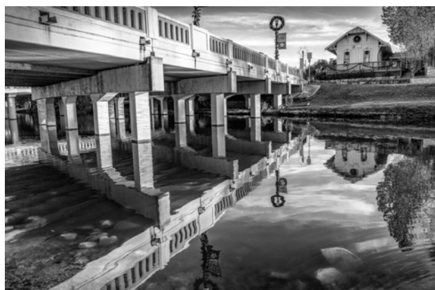
MONOCHROME “Reflections In Boerne” Peter Florczak