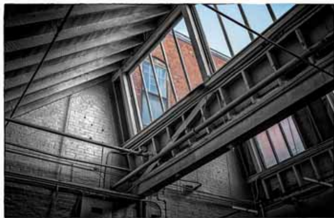
PICTORIAL tied for 1st Place “Skylight in Color” Peter Florczak