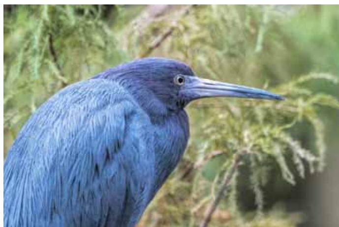
NATURE “Little Blue Heron”