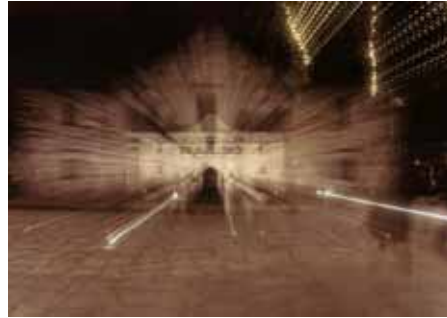
CREATIVE tied for 3rd Place "Flashes of Light" Brian Duchin