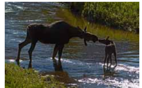
NATURE "A Mothers Touch" Ken Emrie