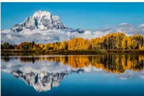
PICTORIAL tied for 2nd Place “Ripples in the Reflections” Bill Hunsicker