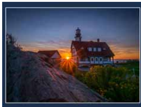
TRAVEL “Sunrise at Portland Head Lighthouse” Dick Boone