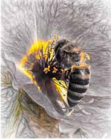
CREATIVE tied for 2nd Place “The Pollinator” Bill Hunsicker