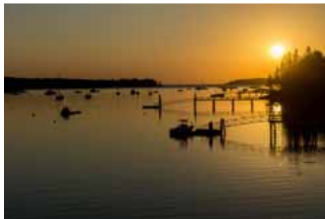
PICTORIAL tied for 2nd Place “Sunset in the Bay” Peter Florczak