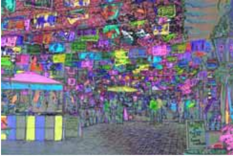
CREATIVE tied for 3rd Place "Market Square" Peter Aradi