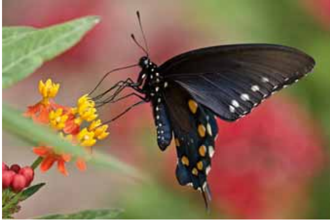
NATURE "Pipevine Swallowtail"