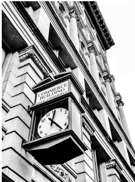
MONOCHROME "State Street Clock" Peter Florczak