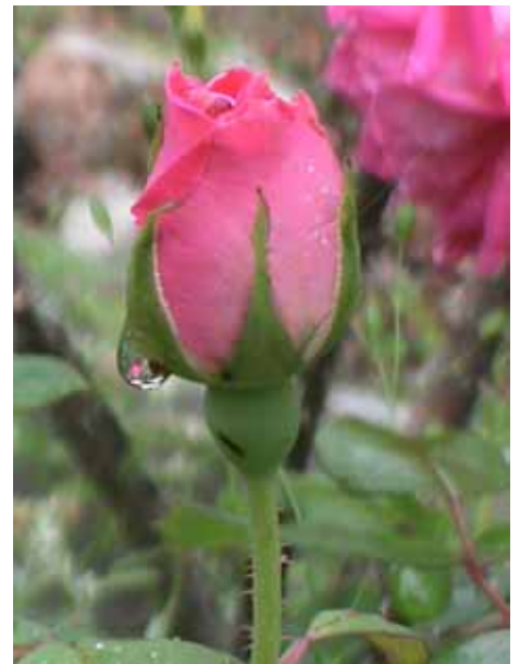
Early Morning Raindrop