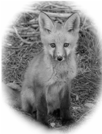
MONOCHROME tied for 2nd Place "Red Fox Pup" Jack Smith