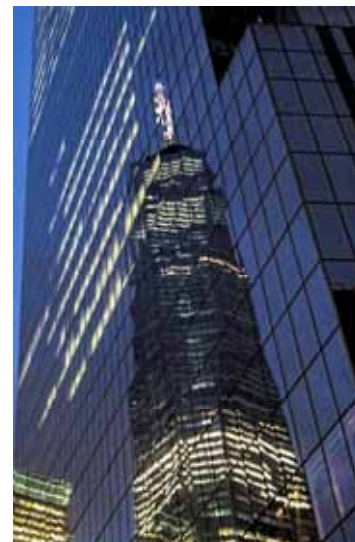
ASSIGNMENT "Freedom Tower" Brian Duchin