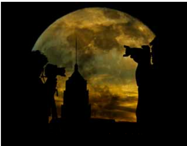
CREATIVE "Night Photography" Peter Florczak