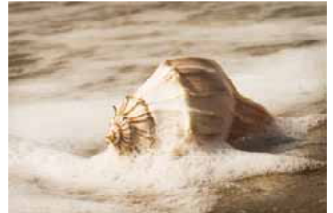
PICTORIAL "Lighting Whelk Sea Shell"