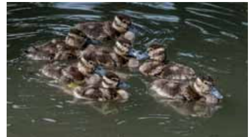
NATURE tied for 2nd Place "There Always Seems to be One" Dick Boone