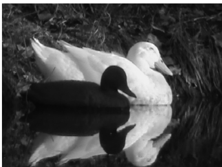
I'm in Love With a Decoy