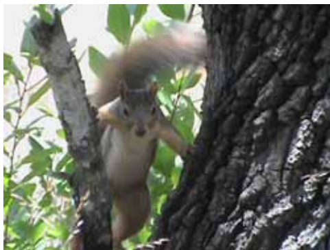
My Tree! Go Away!