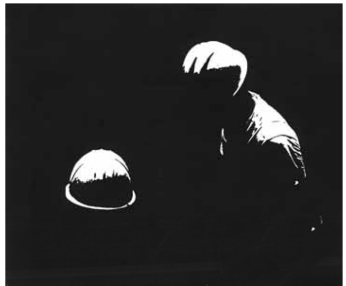
Pipeline crew at work