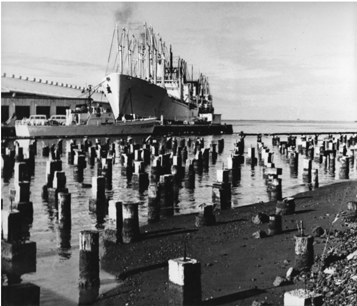
Honolulu Harbor 1958

Over the last 15 years I owned several cameras; finally settled on a Nikon D7200 with the 18-140mm kit lens, a Nikon 50mm f1/8 prime lens and a Sigma 10-20mm wide angle zoom.