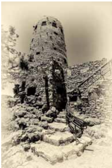
MONOCHROME "Desert View Watch Tower" Dick Boone