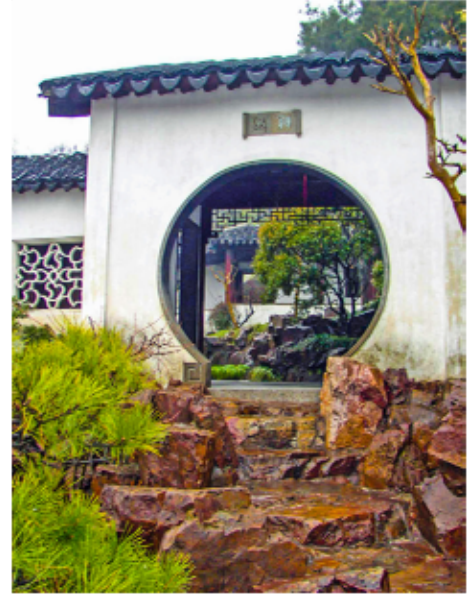
Moongate in a Suzhou garden, China

I spend most of my time reading, mainly about Northeast Asia, especially historical texts, and art history, and take on-line university courses on the same topics.