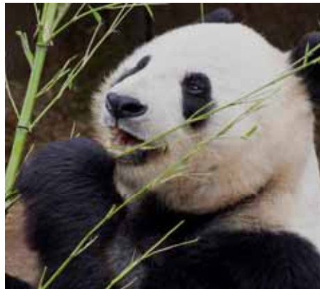
NATURE tied for 3rd Place "Breakfast" Brian Duchin