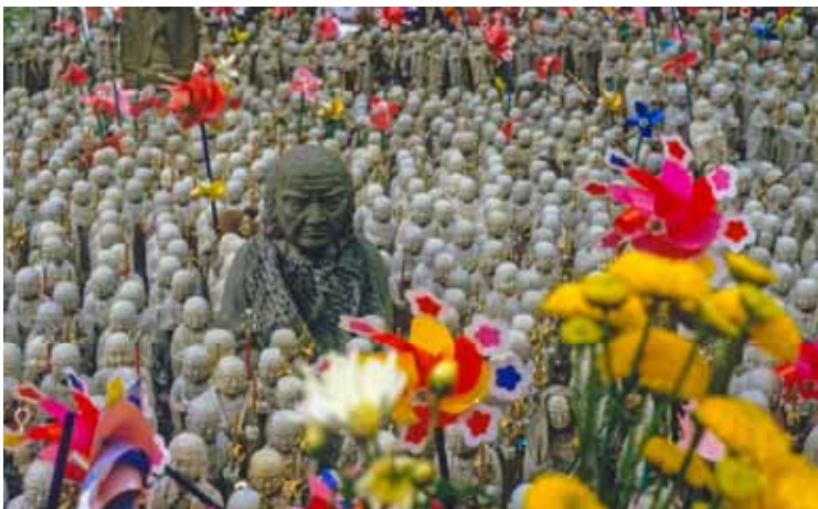
Memorial for aborted fetuses, Kamakua, Japan