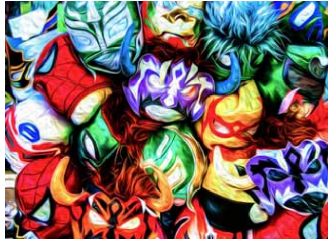
CREATIVE "Masks at Market Square" Peter Aradi