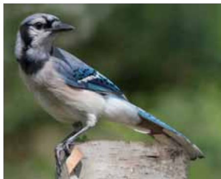
NATURE tied for 3rd Place "Bluejay" Dick Boone