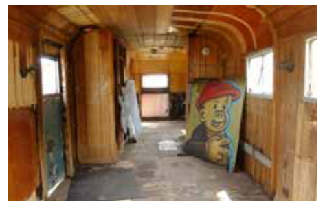
ASSIGNMENT "Old Travel Trailer" Tim Kirkland