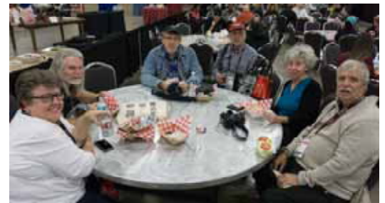
Some of our members enjoying a meal at the ImagingUSA Expo in San Antonio