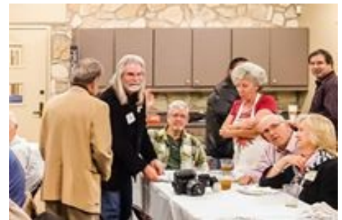
2016 Annual GSACC Christmas Party