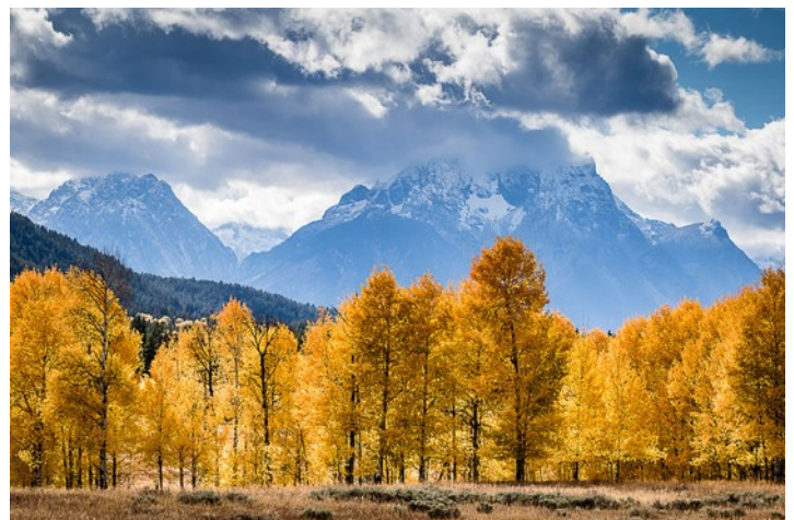
ASSIGNMENT Bill Hunsicker "Cottonwood Color"