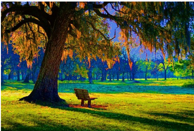
PICTORIAL COLOR Holly Emrie "Only in a dream"