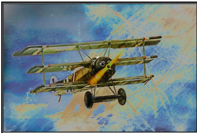
CREATIVE Dick Boone "Battling the Ravages of Time"