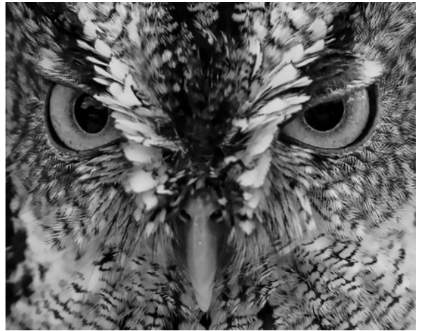
MONOCHROME Dick Boone "'Eyes of the hunter'"