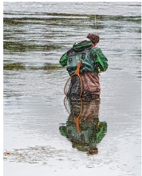
CREATIVE "Yellowstone River Angler" by Dick Boone