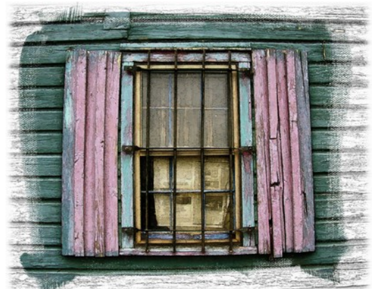
CREATIVE 1 st tie "Broken Window" by Peter Florczak