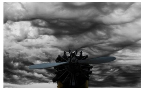
CREATIVE 1 st tie "No Flying Today" by Tim Kirkland