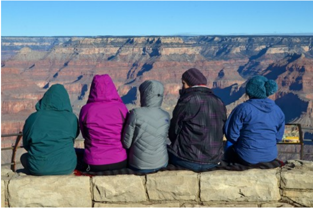
PHOTOJOURNALISM "Waiting for Sunset" by Ken Emrie