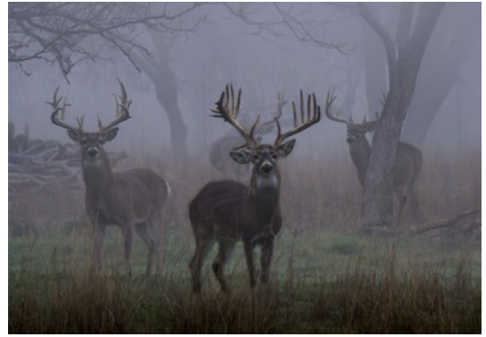
NATURE "Deer Stare"