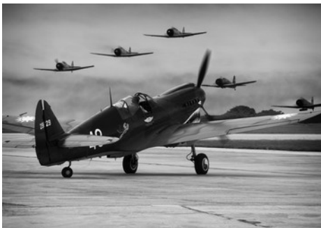
MONOCHROME 1 st tie "Under Attack" by Brian Duchin