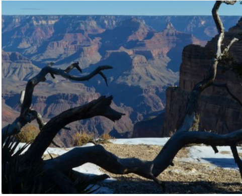
PICTORIAL COLOR "View from Yavapai Point" by Ken Emrie