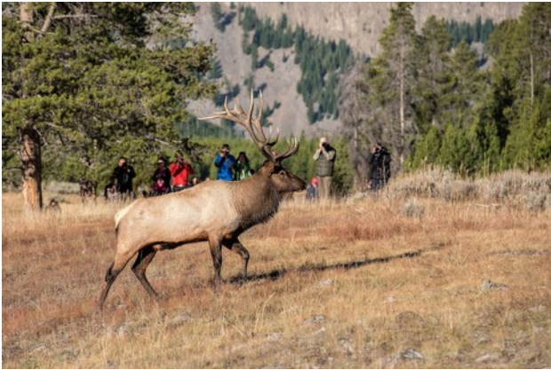
PHOTOJOURNALISM "Wildlife Photographers" by Jack Smith