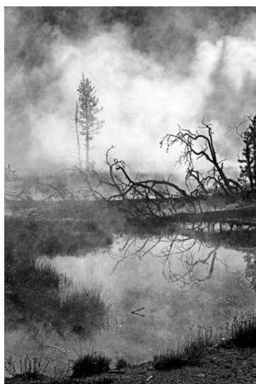
MONOCHROME "Foggy Pond" by Tim Kirckland