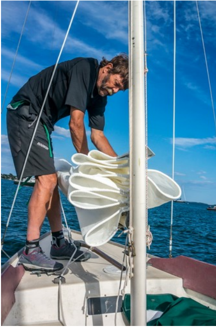
PHOTOJOURNALISM "Sailing" by Peter Florczak