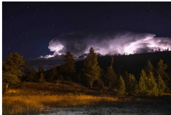
NATURE "Yellowstone Thunderstorm"