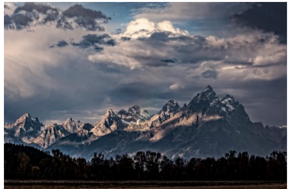
PICTORIAL COLOR "Storm in the Mountains" by Dick Boone