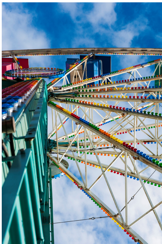
Up and Away