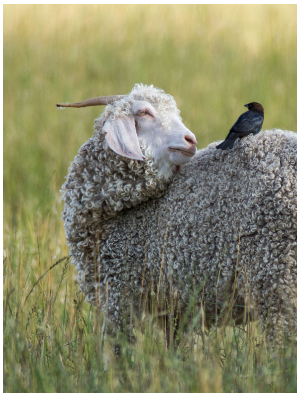
Goat and Bird