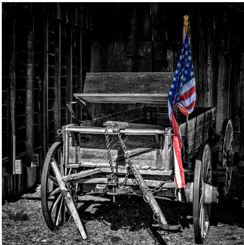
Old Glory Days