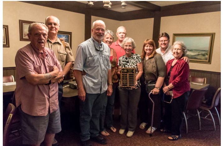
Scavenger hunt luncheon on June 6 with GSACC and Houston Camera Club members in Schulenburg.