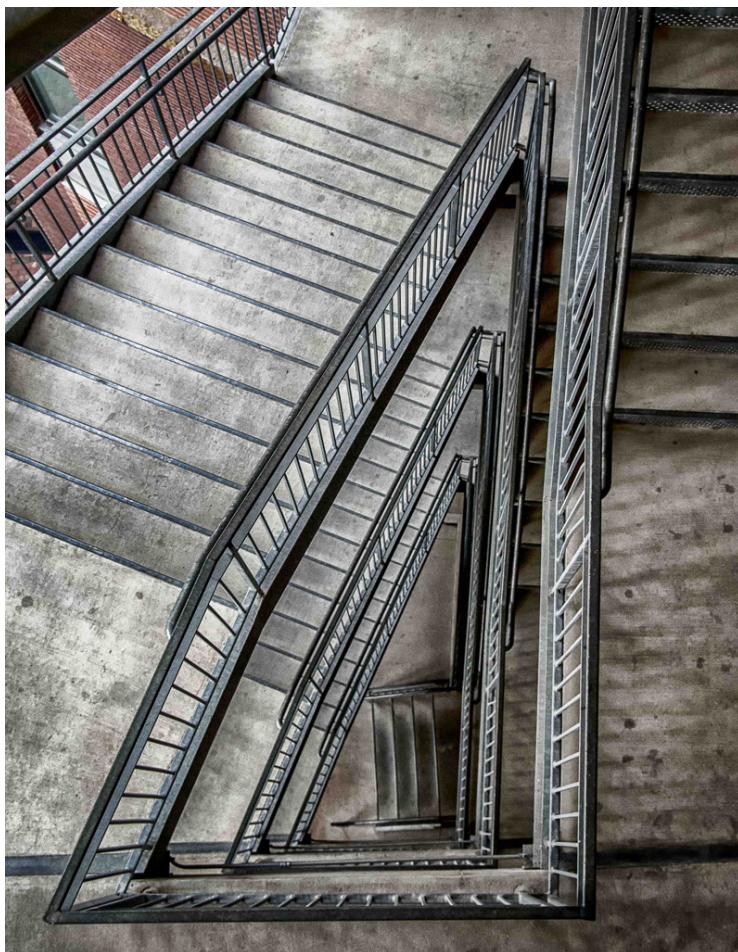
Down the Staircase