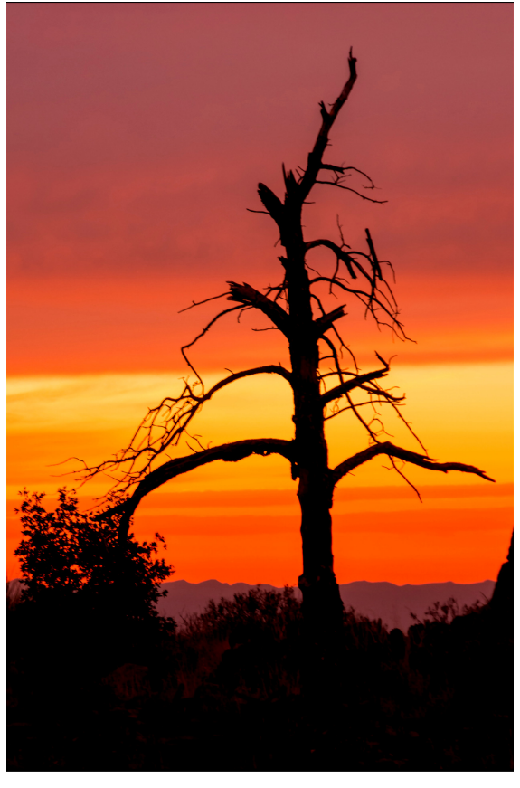
Sunset through the Window by Dick Boone

See more of our photos online at http://www.gsacc.org/photo-gallery.html