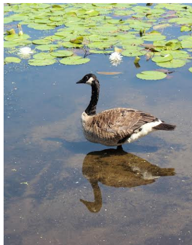
Cover photo: Canada Goose by Tim Kirkland

Dues may also be mailed to our post office box. That address is listed on the back page of this issue.