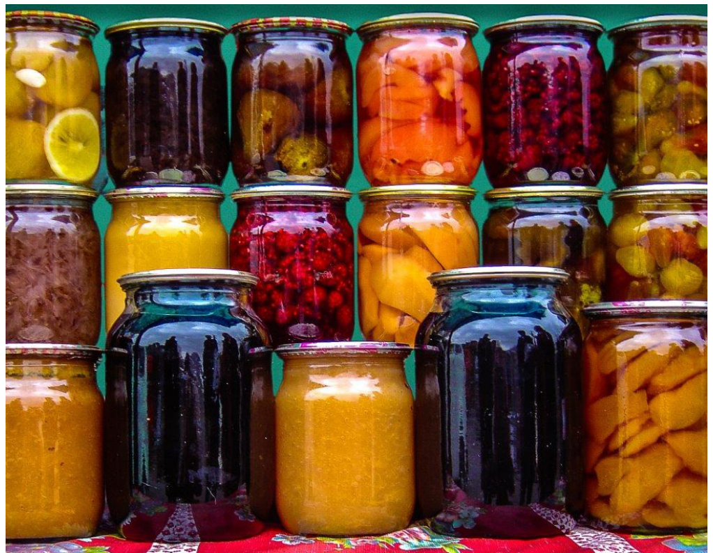
Bottles of Fruit