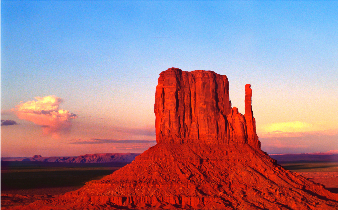
Monument Valley at Sunset