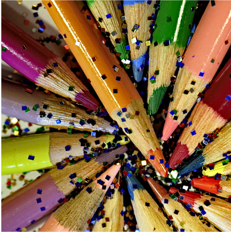
◀ All That Glitters by Art Nisenfeld