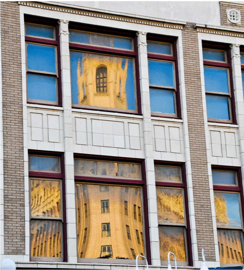
The Emily Morgan Reflected