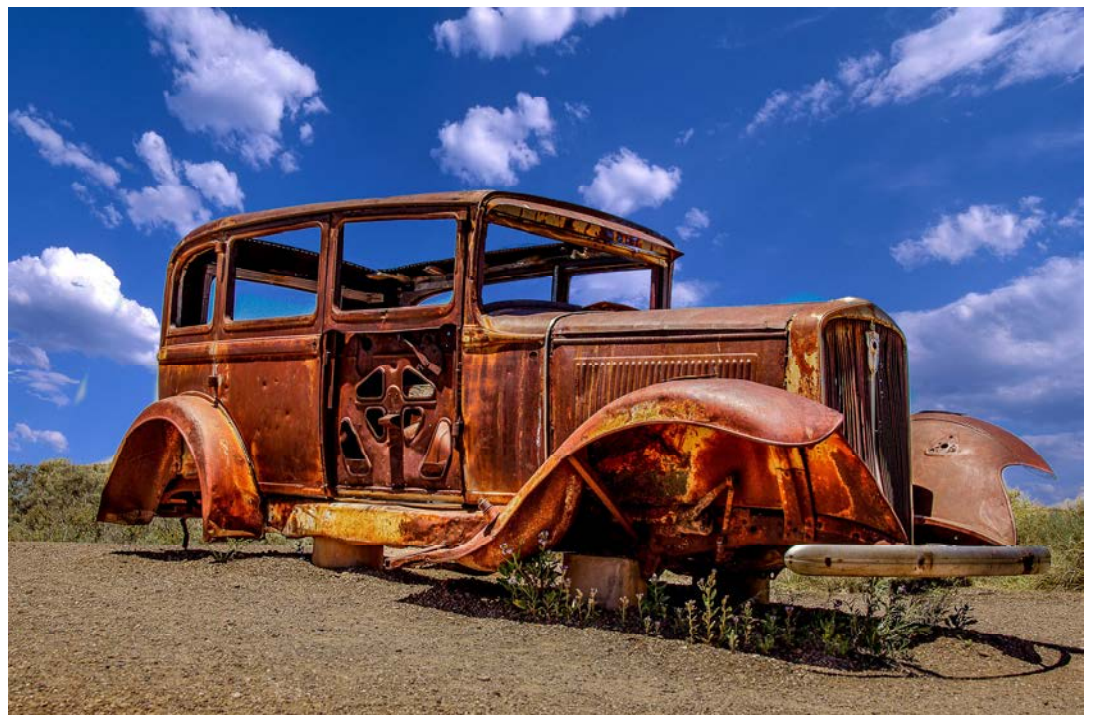
Route 66 Icon